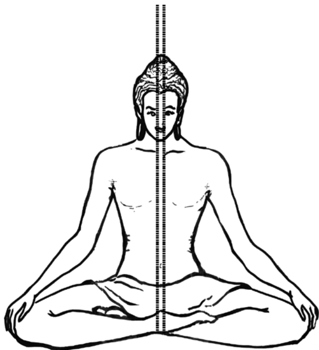
The shushumna or core (body's axis)

ing belief systems, and so forth—have been wrapped tightly around it and have hidden it from our conscious view. In fact, they resemble a coating of thick, black leather, like a sleeve, around the core. Between the chakras are locks where the veils constrict and cut off the flow of light and energy through our physical body. The illuminating flow of kundalini, once liberated,